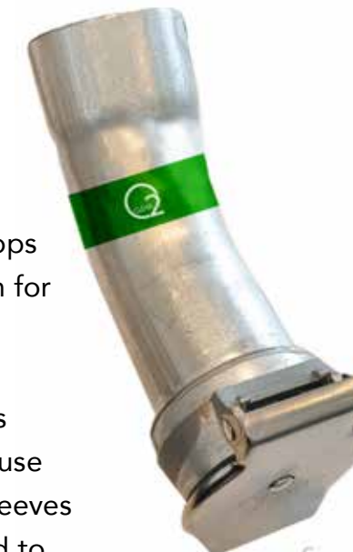
Single Wall-Mounted or Hanging Drops

Translas systems are designed for convenient use with vacuum drops (or work stations) and can be placed exactly where you need them for increased productivity. Work stations can also be equipped with microswitches so that the system turns on and off automatically. Metal tubing is superior to PVC or ABS piping as it has long radius bends and does not generate static electricity. All of our systems use graduated 14 to 16 gauge steel tubing secured with heat shrink sleeves or optional compression couplings. The system is also guaranteed to maintain airflow at approximately 90 cubic feet per minute at each vacuum inlet port.