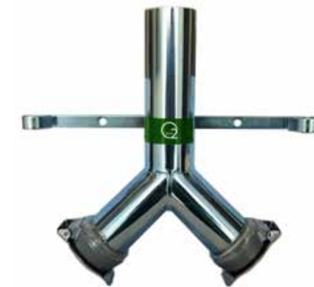
Double Wall-Mounted or Hanging Drops